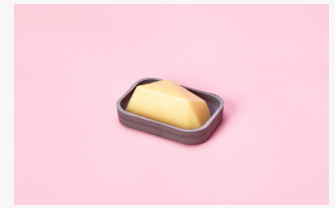
Geometric soap and the dish for it to live in