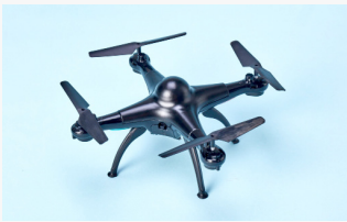
An aerodynamic drone casing