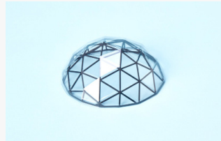
Mock up glasswork for a geodesic dome