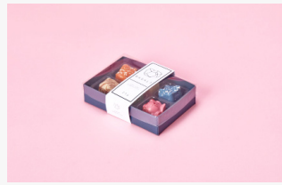
A box of chocolates and packaging