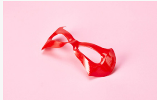
A set of coloured superhero masks