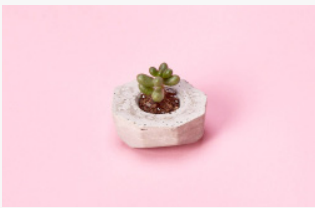
Concrete cactus pots